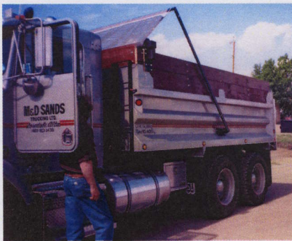
Electric Drive Unit