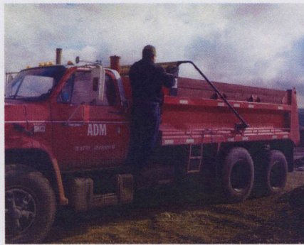
Upper Crank Drive Option